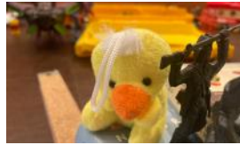
SERGEANT DUCKY ALSO ON THE FRONT LINES