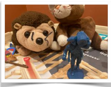
Captain Prickles and General Pounce

Meanwhile, the fortress is under heavy firepower, and the inhabitants will probably not be able to escape.