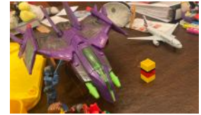
THE GOOD ZURG SHIP, ON THE FRONT LINES