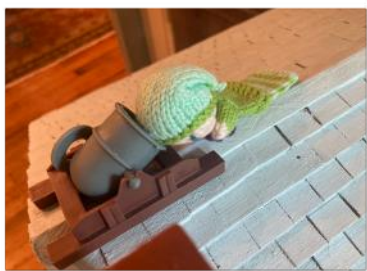
Elf cleaning out the siege cannon on top of the dollhouse.

Wu-Wu-Wu Zap, famous criminal villain, has left his old fort and is currently battling in the dining room, on the front lines. Meanwhile, his abandoned fortress has been crushed, crumpled, and heavily attacked. All that remains of it is a pile of rubble, and there may be some Uni traps. But at the top of the guard tower, there is a cannon that costs $20. The original fortress costs $257, but the cannon is just part of it. We will help you clean it out and manage the house by buying the supplies (for example: wood, rock, brick), and also, you won't have to pay any tax! It is in Bingo, on the other very large cliff. It's behind a restricted section, and you have to ask the sentry stationed there if you can go through.