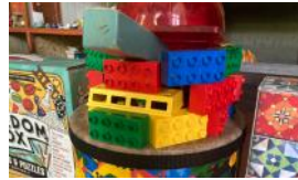
A PILLBOX PROTECTING THE HARBOR OF TRANQUILITY