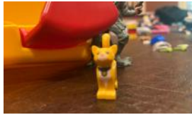
SOX THE BRAVE ROBOT CAT ON THE FRONT LINES